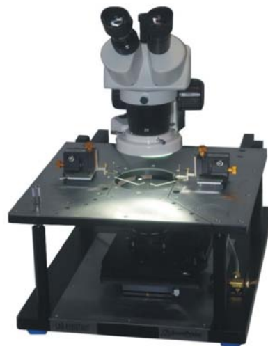
SemiProbe LAB Assistant Probe Station

SemiProbe produces a range of manual probe systems suitable for Universities, Research & Development facilities, Laboratories and for low volume testing & characterisation requirements, including the cost-effective LAB Assistant and Probe System For Life (PS4L).