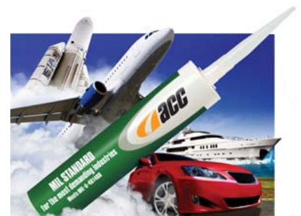
ACC Silicones Adhesives & Sealants

ACC's family of silicone sealants, adhesives and gels nicely compliments DELO's extensive product range of light-cured epoxies & acrylics, die attach and chip encapsulation adhesives, heat-cured and cold-cured epoxies, and Anaerobics and Cyanoacrylates.