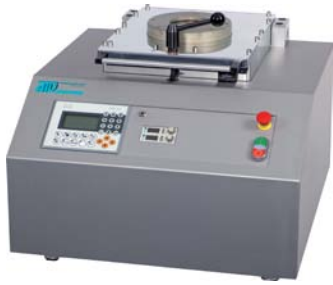
ATV Vacuum Soldering System

ATV, the thermal transfer specialists have released a "Perfect Soldering", SRO700 tabletop model. The "Perfect Soldering" systems, solder reflow ovens (SRO) with rapid thermal annealing and brazing capability are IR lamp heated multi-purpose "cold wall" process ovens. The SRO700 is ideal for R&D, process development as well as for low to medium volume production.