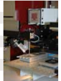
High Bond Force