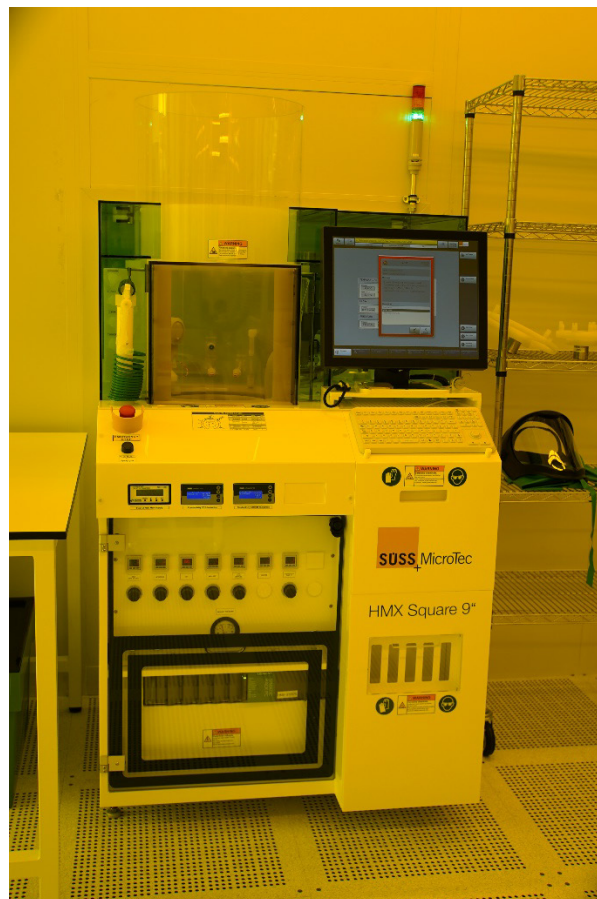
Above, the SUSS MicroTec HMX Square 9 photo mask cleaner, part of the equipment supplied to the Institute for Compound Semiconductor by Inseto.