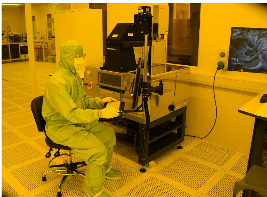
Above, the SUSS MicroTec MA8 Gen4 mask aligner, part of the equipment supplied to the Institute for Compound Semiconductor by Inseto.